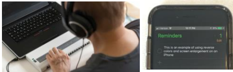
Compassion ~ Dignity ~ Diversity ~ Excellence ~ Honesty