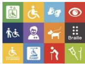
Compassion ~ Dignity ~ Diversity ~ Excellence ~ Honesty