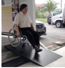
Compassion ~ Dignity ~ Diversity ~ Excellence ~ Honesty