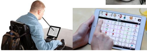
Compassion ~ Dignity ~ Diversity ~ Excellence ~ Honesty