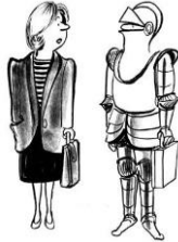
© 2016 MasterControl Inc. All rights reserved 13